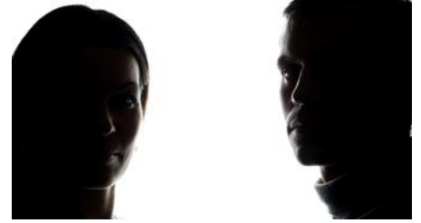
How to Listen Without Getting Defensive