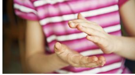
How to Get Your Kids to Listen