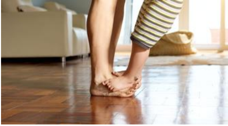
Conducting These 3 “Mom Audits” Made Me a Better Parent